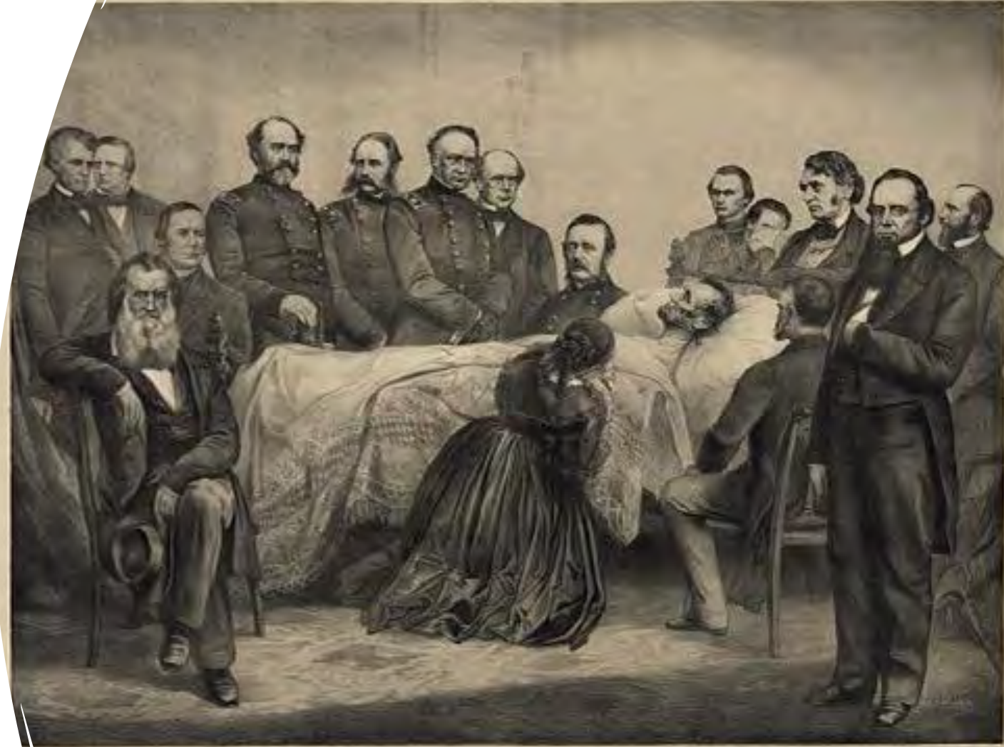
DEATH BED OF LINCOLN

Many peoples around the globe, including Jewish and Muslim people, have always been buried in this way.