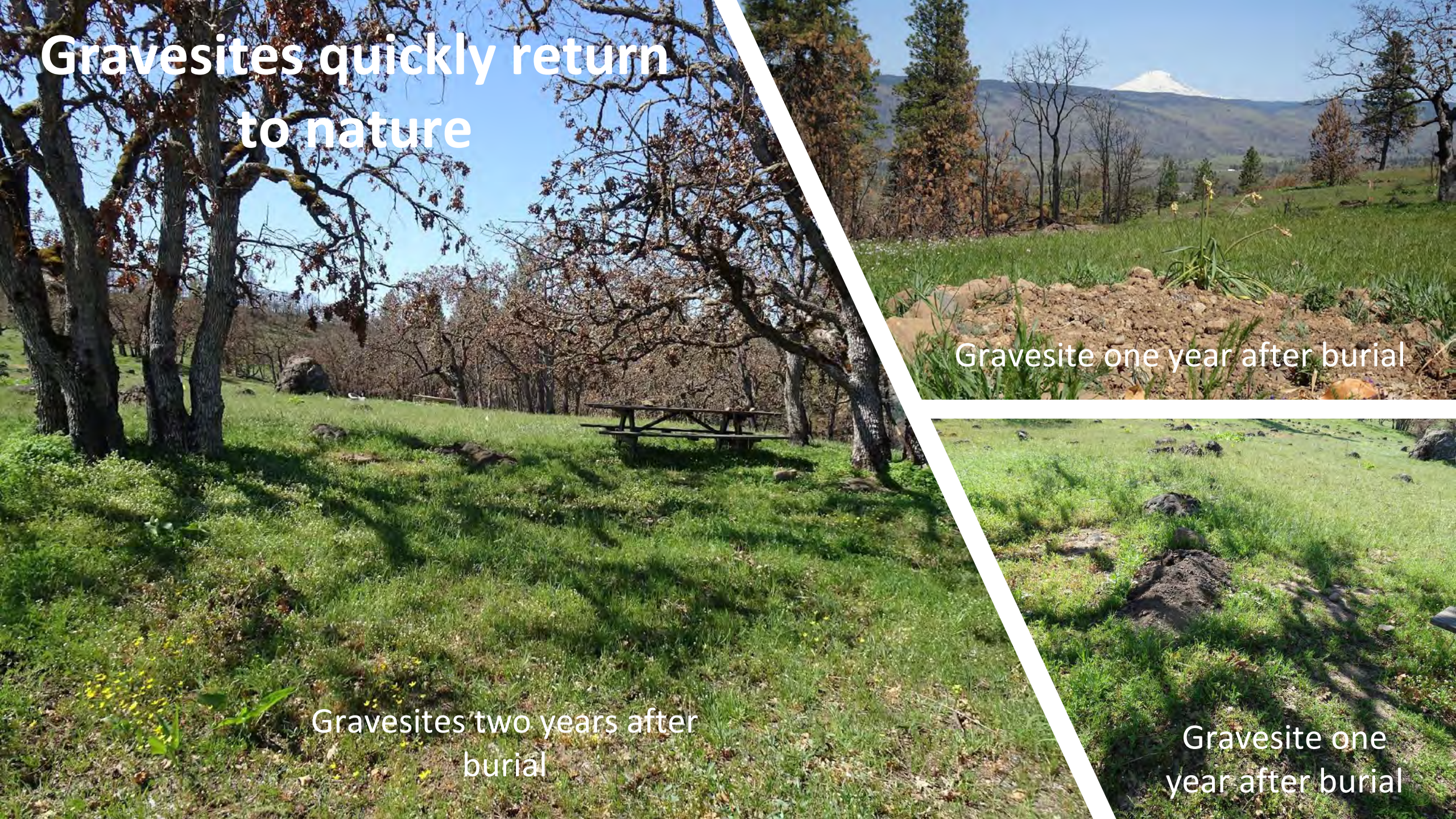
Gravesite one year after burial