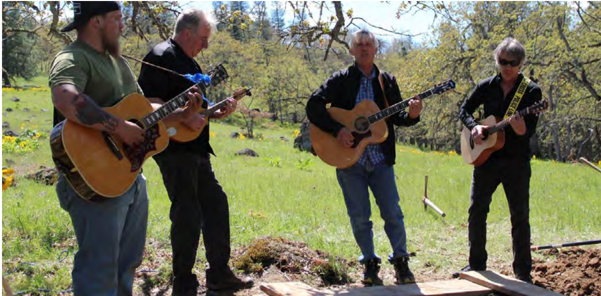
Funeral service may be conducted entirely in nature, family and friends often participate